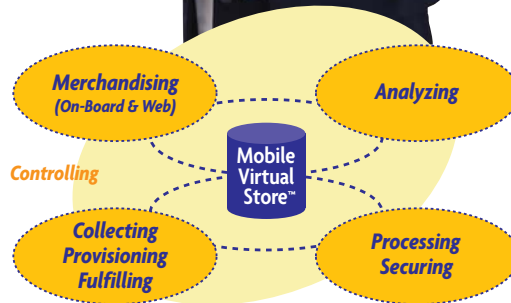
The Mobile Virtual Store™ Selling Platform